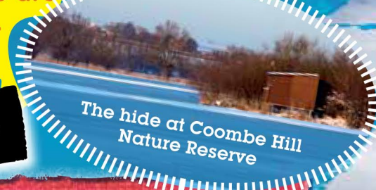
The hide at Coombe Hill Nature Reserve

Coombe Hill & Ashleworth Ham Nature Reserves are the best places to go during the winter.