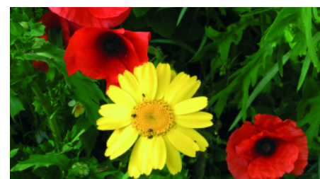
poppies and corn marigold

The ringlet butterfly needs meadow grasses on which to breed