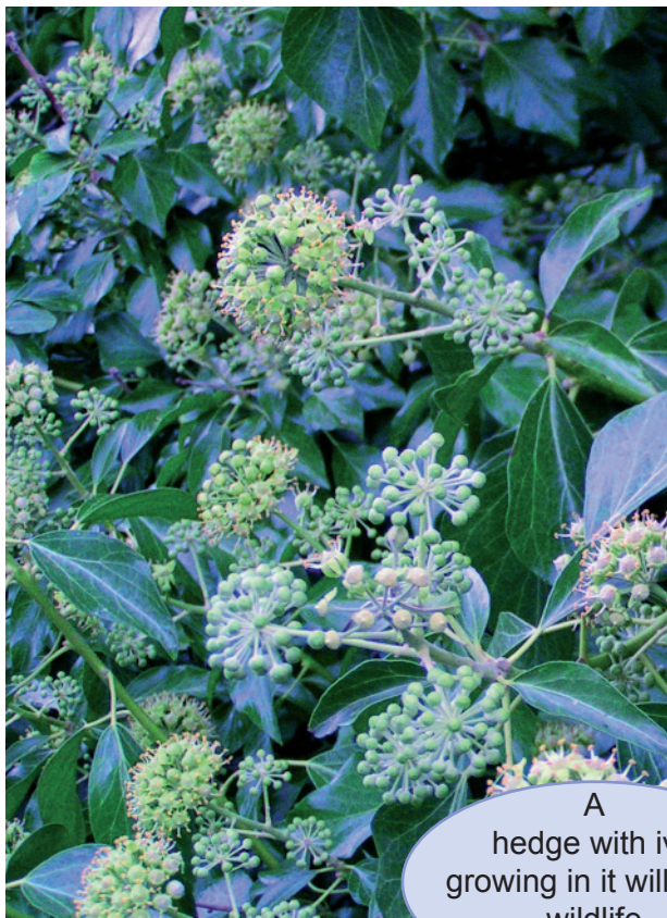
A hedge with ivy growing in it will help wildlife

Climbers can also add extra thickness and interest. This fact sheet shows you how to create and maintain a wildlife-friendly hedge.