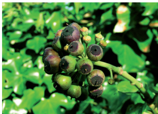
ivy berries - R. Burkmar

Being evergreen, ivy provides shelter for over-wintering butterflies and insects, as well as shelter for birds escaping bad weather. In spring and summer, birds will nest in it and during autumn, the flowers and berries provide a vital late source of food for many insects and birds. The Holly Blue butterfly will also lay its second batch of eggs on it in autumn.