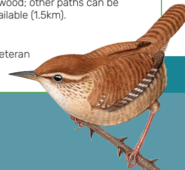
Illustrations: Speckled wood butterfly (top left), Wren (bottom right). © Abi Stubbs